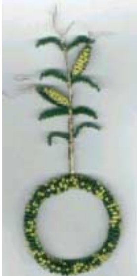
Mini Corn Plant or Corny Napkin Rings