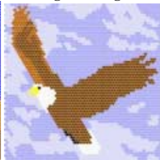
Morning Prayers Tapestry