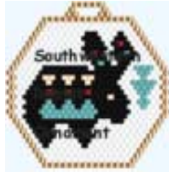
Southwestern Rabbit Ornament