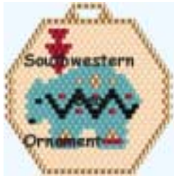
Southwestern Bear Ornament